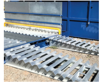
Galvanized side-screens, ramps & grids