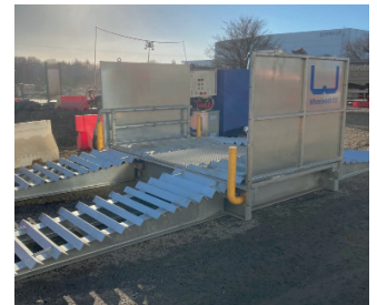
Galvanised side-screens, ramps & grids