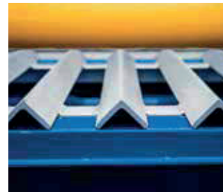
Unique washdown & removable grids