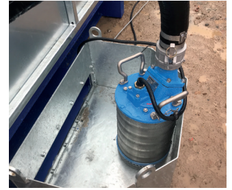
Surface mounted sump for easy maintenance