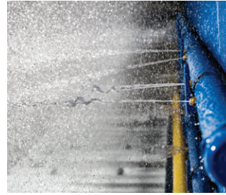
Unique, effective spray design