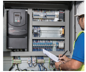
Adjustable power & reduced costs with the inverter drive