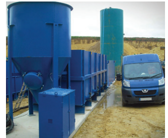
Unique settlement with optional electrical valve