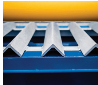
Unique washdown & removable grids