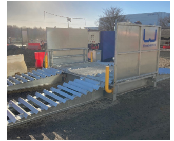
Side-screens, ramps & grids