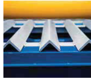
Unique washdown & removable grids