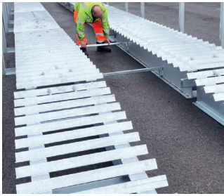
Low profile ramps prevent grounding