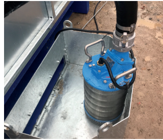
Surface mounted sump for easy maintenance