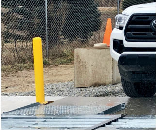
Targeted spray for maximum effectiveness