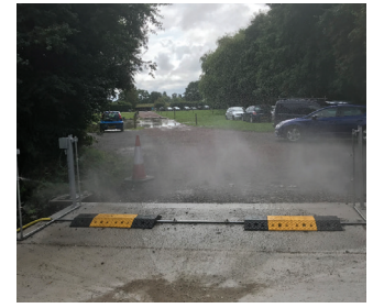
Targeted spray for maximum effectiveness