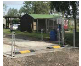
Option to disinfect on entry and exit