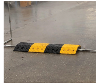
Suitable for all vehicle types